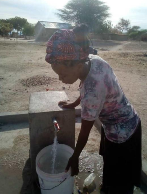
Villagers fetching water in the water distribution points constructed