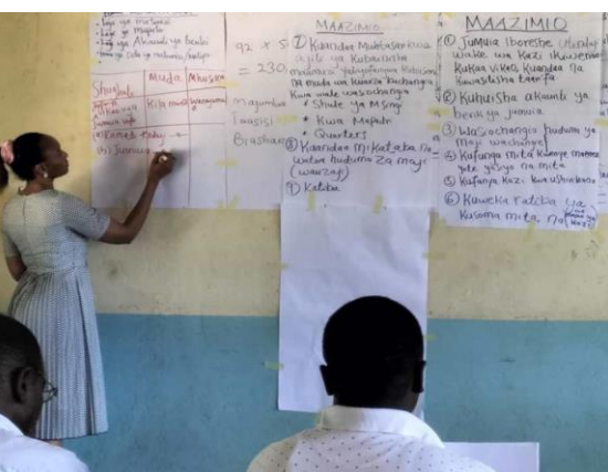
Water Users Association in the venue for training