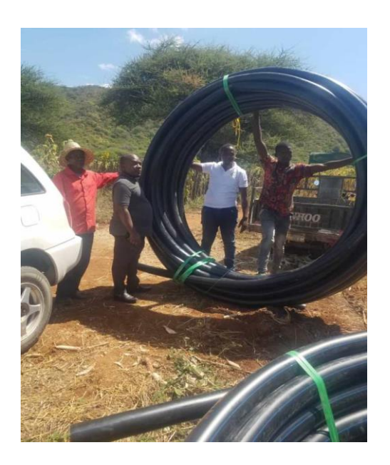
The pipes to be laid out in trenches