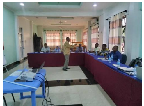
Participants during hosting organisations seminar in Morogoro